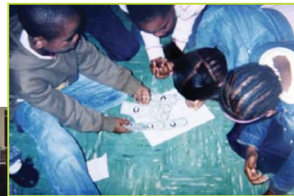
(Above) Students at Plummer Elementary School talk about living expenses during a "Money for the Month" budgeting exercise. (Left) Affordable housing presentation at Camp Givehope.