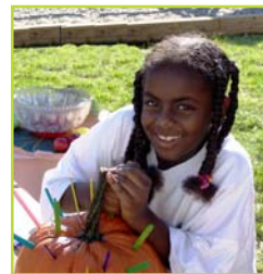
Pumpkin painting fun at Agape House.

WHDC participated in the Unitarian Universalist Church of Arlington's annual Working Together Week this fall. Church volunteers helped organize three WHDC service projects on Saturday, October 21. A Mom's Day Out was held at Agape House. Bowl America Fairfax donated an afternoon of bowling for the moms, while volunteers held an activity-filled Halloween party for the kids. At Springdale House, volunteers arranged a While You Were Out: Backyard Edition